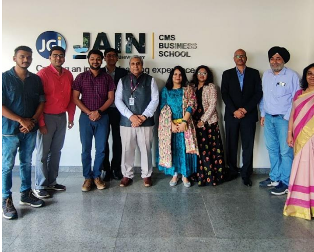
Fig 3: Faculties from ENVC area and Industry Experts on SAMVAD